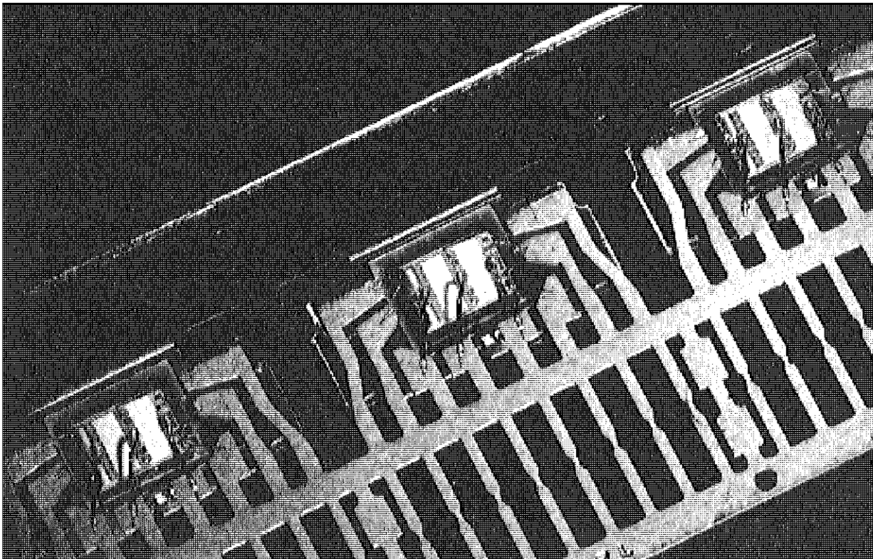
Figure 1: Part of an almost completed strip of integrated circuits utilizing the new mixed bonding technology. The gold and aluminum wires connecting the silicon chip — the small gray rectangle — with the gold-plated external connections can be clearly seen.

Increasing the thickness of the gold wires is ruled out partly because of cost, and also because they are too rigid to weld to the surface of the chip without damaging it. It is possible in theory to use two or more gold wires in parallel for each connection but this solution is generally impractical because the large number of bonding pads waste space on the chip (the cost of a silicon chip is proportional to its area), the cost of the wire is excessive and because testing each bond is difficult.